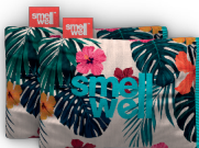
Hawai Floral Art.1509