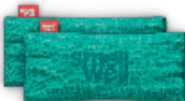
Sensitive XL Green Art.3409