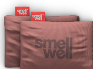
Blush Pink Art.1712