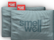
Light Grey Art.1711