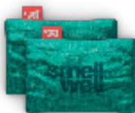
Sensitive Green Art.4409