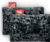
Sensitive Grey Art.4411