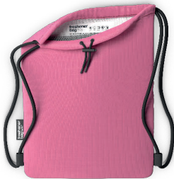
Pink XL Art.6111