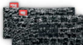
Sensitive XL Grey Art.3411