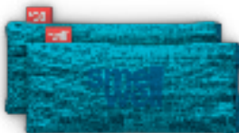
Sensitive XL Blue Art.3410