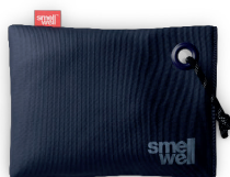
Midnight Blue Art.0409