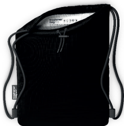
Black XL Art.6109