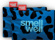
Leo Blue Art.1511