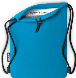
Blue XL Art.6110