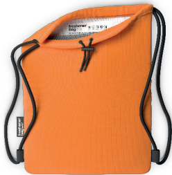
Orange XL Art.6112