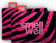
Pink Zebra Art.1513