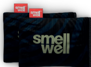
Black Zebra Art.1514