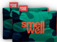
Camo Green Art.1510