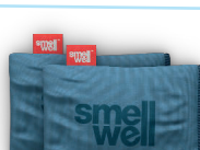
Geo Grey Art.1515