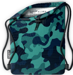
Camo XL Art.6114