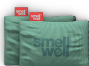
Pastel Green Art.1709