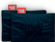
Midnight Blue Art.1710