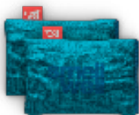
Sensitive Blue Art.4410