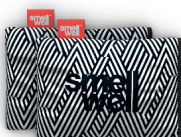
White Stripes Art.1521