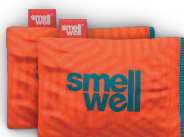
Geo Orange Art.1516