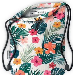
Floral XL Art.6113