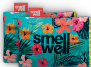
Tropical Blue Art.1519