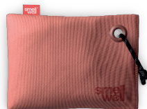
Blush Pink Art.0411

SMELLWELL MAXI FRESHENER INSERT MASTERCASE